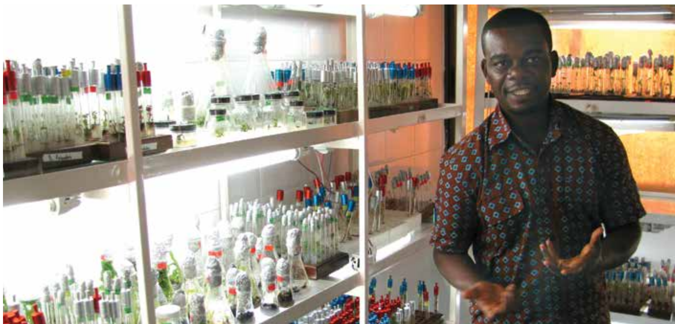
In vitro cultures at Ghana’s national genebank in Bunso

Deploying genebanks’ diverse resources widely and increasing linkage with rural communities helps conserve agrobiodiversity, improve farmers’ incomes, and address climate change and food security challenges. However, policy mechanisms often fail to establish genebank-to-farmer connections. In Rajasthan, India, growers have lost access to the traditional pearl millet varieties that perform best in drier areas. 81 Yet over 30,000 traditional pearl millet accessions are stored in India’s two main genebanks. Farmers have expressed willingness to pay for obtaining these varieties at the market prices of hybrids, but government extension services promote the use of hybrids instead of local varieties. 82 The World Bank could encourage policymakers to establish mechanisms to identify genebank varieties that outperform industrial seeds, and use extension services to disseminate them in regions where they are lacking. Instead, the EBA’s narrow regulatory framework orchestrates the monopolization of public genetic resources by private breeders. The maintenance of genebanks requires significant staff, material, and financial resources, but many genebanks in the world run on precarious funding and are under staffed. 83 While governments continue to bear the cost of maintaining functional genebanks, the EBA’s “good practices” do not take into account the necessity of channeling back a share of private companies’ profits into the public systems that serve them.