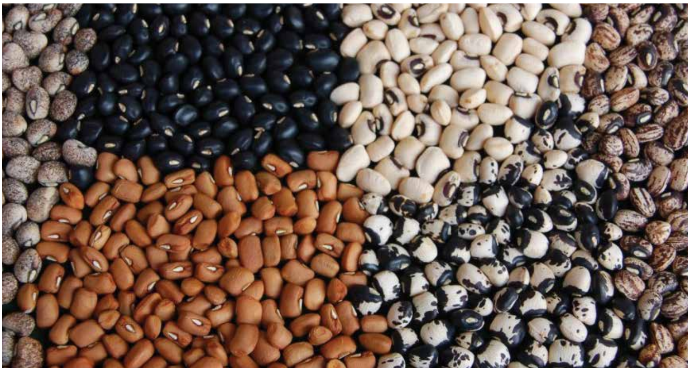
Cowpea seeds germplasm on display at IITA's genebank

However, there is no conclusive evidence that IPR laws will significantly increase private investments in plant breeding in developing countries. 56 In addition, the EBA upholds UPOV membership as a regulatory paradigm, at the expense of sui generis legislation that may be better adapted to local needs. For instance, the 2016 EBA report praises Tanzania for becoming “bound by the 1991 UPOV Act in November 2015,” even though it already had a PVP law in place. 57 The Tanzanian PVP legislation stipulates that farmers can be charged under criminal law – they risk fines and imprisonment – for using and exchanging protected seeds without the breeder’s authorization. 58 The use of non-certified seeds is also prohibited in Tanzania’s official rice irrigation schemes. 59 Recently, the World Bank indicated that both Vietnam 60 and Rwanda have used the EBA to design their new seed ordinances. 61 In Rwanda, the new law establishing PVP regulations conforms to the UPOV Convention (see Box 3). 62