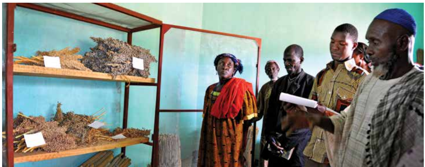
Farmers consult together to select and save a diverse variety of seeds in the banks

Through the EBA, the World Bank reduces farmers' role to that of seed consumers and confines policymaking to the privatization of seed systems. Yet there are many ways governments can support the participation of farmers in breeding and distributing beneficial varieties. The World Bank continues to ignore the calls of a wide range of experts and institutions for bottom-up seed solutions benefiting the poorest 132 and remains entrenched in the defense of corporate interests. This not only jeopardizes the culture and livelihoods of farmers in developing countries, but also contradicts the primordial wisdom, which, for millennia, has pushed humans to nurture, improve, and exchange the earth's rich resources.