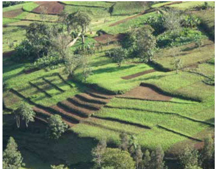
In Ethiopia's Gamo Highlands, traditional agriculture practices preserve high levels of agrobiodiversity

This carefully cultivated agrobiodiversity helps sustain communities through times of environmental crisis, rising population density, and other threats. In Ethiopia's Gamo Highlands, traditional practices relying on plant diversity – over 40 varieties of barley and 100 varieties of banana are cultivated in the region – and active seed exchange have preserved food security and resilience of local populations. By contrast, neighboring communities who practice intensive monocropping on the plateau of Wolaita experience annual food shortages and decreasing soil fertility. 104 In Papua New Guinea, an average family grows between 30 and 80 species of food crops. 105 Such diversity ensures nutritious diets and helps farmers endure periods of drought as well as heavy rains. Papuans' taro varieties, for instance, survive prolonged rains, but are negatively affected by droughts, during which farmers rely on sweet potato and cassava for food staples. 106