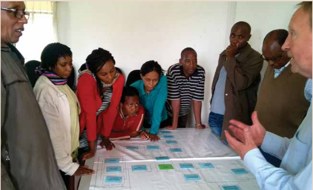
The Dutch Inspection Service for Horticulture trains Rwandans to implement breeders' rights in conformity with the UPOV guidelines

These reforms do not seek to address the needs of Rwandan farmers, but copy a regulatory model promoted by the seed industry and Western donors as being the one that will attract private investors and enhance seed development and innovation. 71