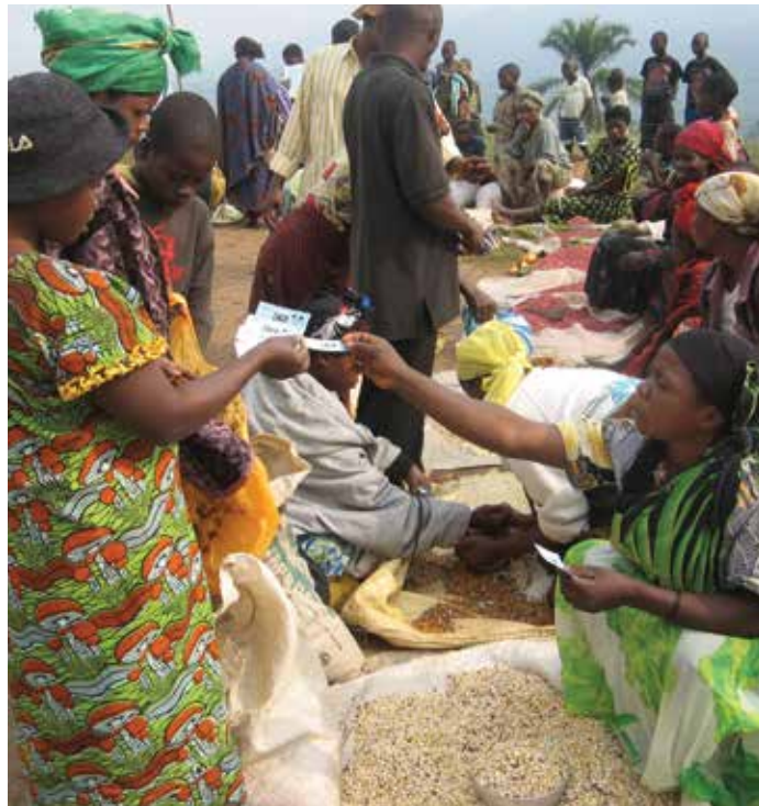
A seed fair in Democratic Republic of Congo © Alexa Reynolds, ACF DR Congo

growers specialize in the multiplication, production, and sale of seeds, 126 and circulate seeds through local networks, often reaching remote locations and disseminating valuable information on varieties' properties and planting methods. 127 In Uganda and DRC, two war-stricken countries, the organization of seed fairs attracted numerous vendors and helped restore households' seed stocks, boost the local economy, and improve agricultural productivity. 128 In Zimbabwe, a local seed bank initiative enabled a drought-affected community to save over 6 tons of seed in just four years. The seed bank serves as a buffer in times of individual or community crop failure. 129