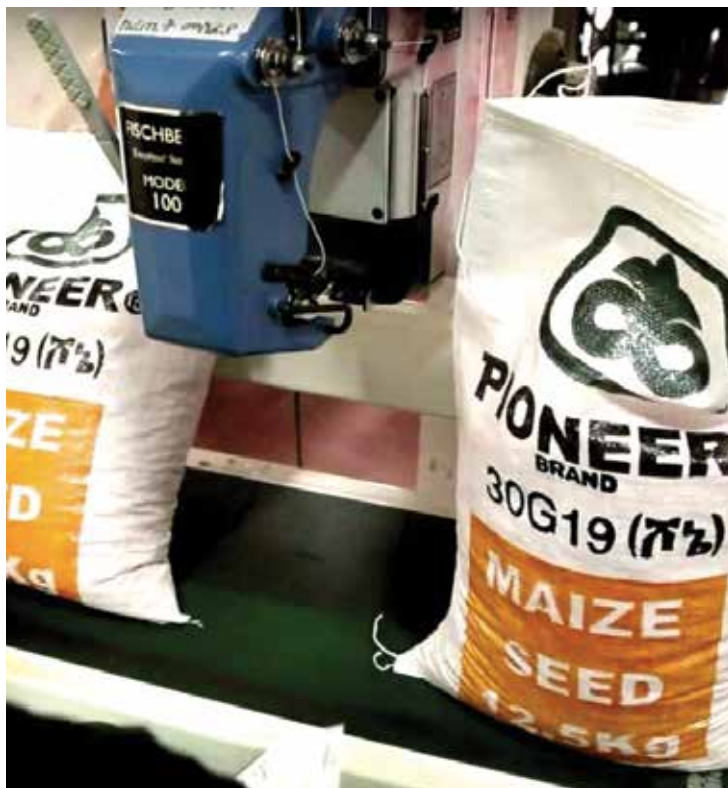
Dupont maize seed in Ethiopia

This strong stance to increase private sector representation suggests a total lack of consideration of farmers, consumers, and the environment. The EBA methodology accords a country a maximum score if all VRC members are from the private sector, even though this raises serious concerns about transparency, independence, and the competence of the authorities presiding over the release of new seed varieties.